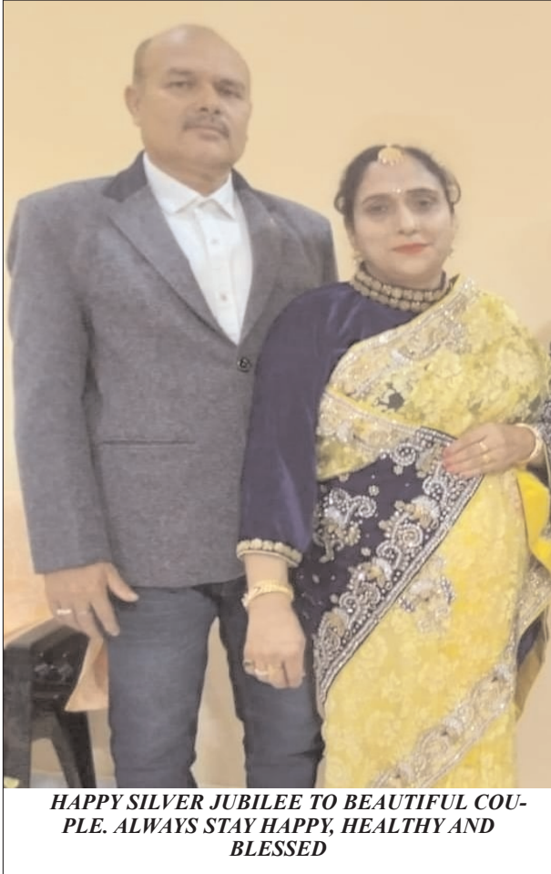
HAPPY SILVER JUBILEE TO BEAUTIFUL COUPLE. ALWAYS STAY HAPPY, HEALTHY AND BLESSED