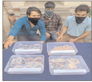
Broad Daylight Heist to Police Custody: The Spectacular Fall of Greater Kailash Sensational Gold Shop Robbery Puzzle – Solved by Jammu Police, South Zone

NEWS P-3 NEWS P-5 NEWS P-12 NATIONAL P-8 SPORT P-7