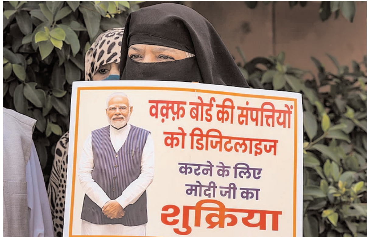
A woman holds a placard in support of Waqf Amendment Bill during a BJP rally ahead of a debate on the bill in Lok Sabha, in New Delhi.