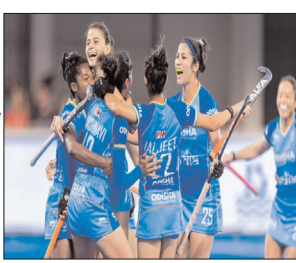
Hockey India trims core group of women players from 65 to 40

Price: Rs.2 | Page 12 | Vol. No.: 15 | Issue No:79 Postal Registration No. JK-458/16-18 epaper.dailyjammurising.in RNI No: JKENG/2011/40494