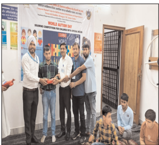
Composite Regional Centre (CRC) Jammu Celebrates World Autism Awareness Day with Special Drawing Competition for Children with Special Needs