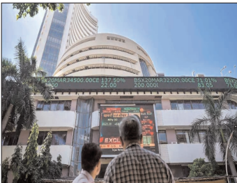
Sensex, Nifty recover nearly 1 pc ahead of US tariff announcements