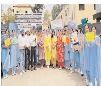
GCOE Jammu organises awareness rally themed "Stay away from drugs"