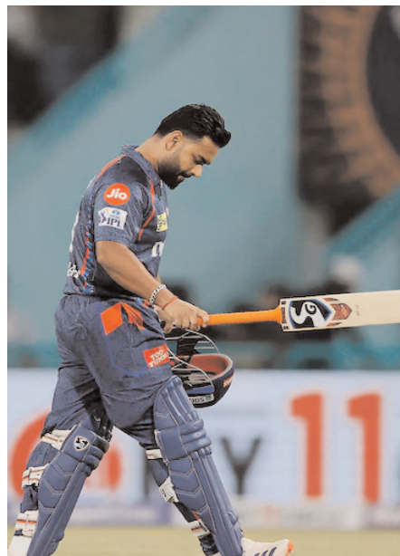
NEW DELHI, APR 3

Rishabh Pant, the costliest player in the Indian Premier League history, has had a forgettable start to the 2025 season. Around four months ago, the wicketkeeper-batter scripted history at IPL 2025 auction after Lucknow Super Giants bought him for a whopping sum of INR 27 crore. Not only in the IPL auction history, but also in the entire event, this was the first time that a player was signed for such a massive salary. However, has failed to live up to the expectations of the franchise so far, returning scores of 0, 15 and 2 in his three innings in IPL 2025 so far.