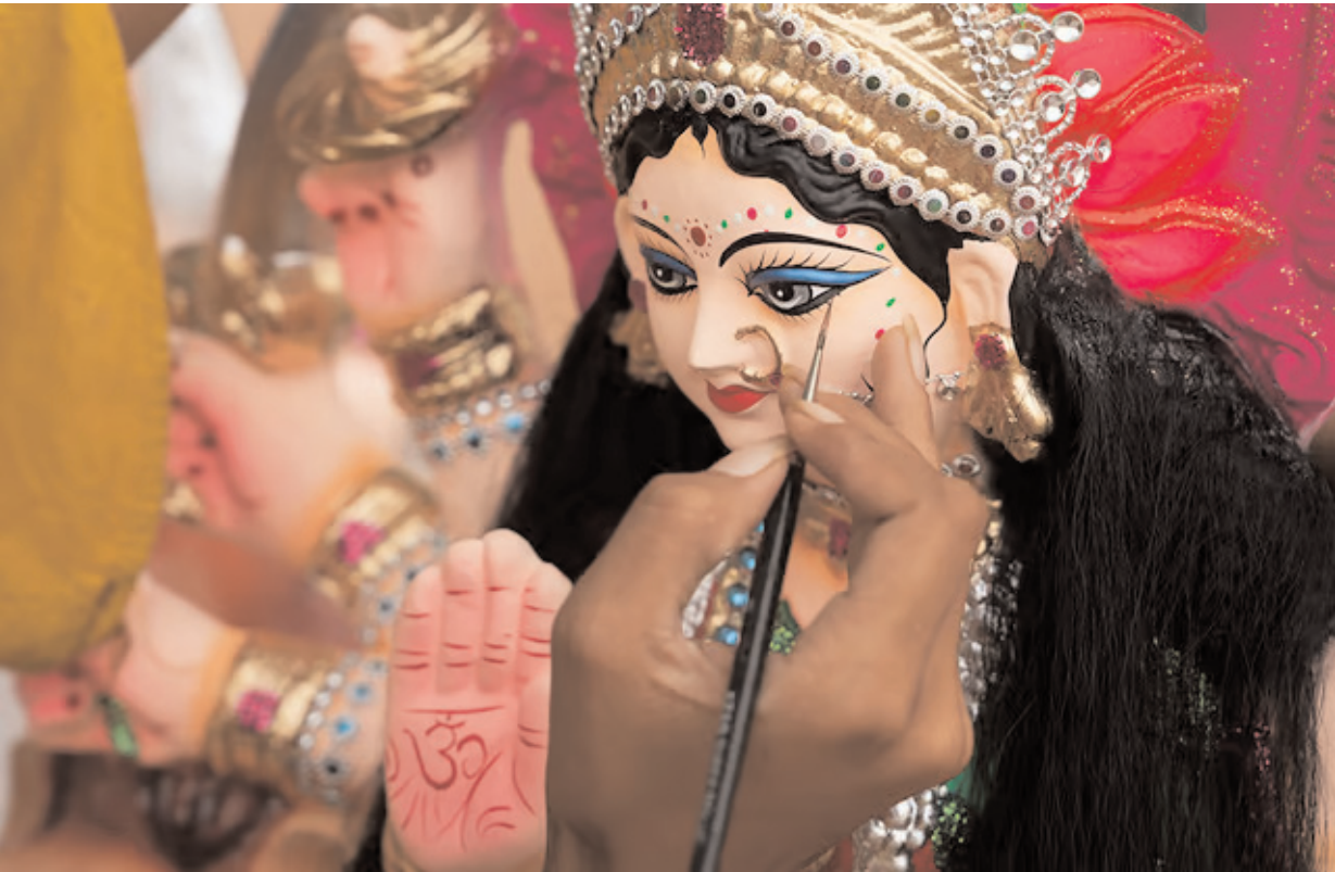
An artist gives finishing touches to an idol of goddess Durga ahead of the Navratri festival, at Mayur Vihar in New Delhi.

The involvement of former President Chandrika Kumaratunga in this developing drama will be widely observed as the election approaches, and many will be watching to see if her purported alliance can resist the increasing wave of change.