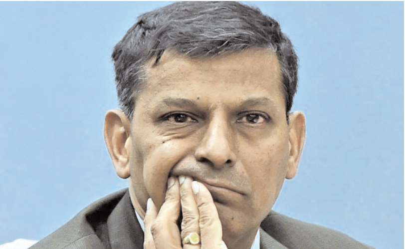
NEW DELHI, SEPT 30

With 7 per cent economic growth, India is not creating enough jobs as reflected by the number of applicants for vacant posts in some states, Reserve Bank's former governor Raghuram Rajan said and suggested the government needs to focus on promoting labour-intensive industries to generate employment. Rajan further said some Indians, especially those at upper level, are comfortable and have high incomes, but consumption growth from the lower half of the country has still not recovered to pre-pandemic level. "That is the unfortunate part...You would think with 7 per cent growth, we would be creating a lot of jobs. But if you look at our manufacturing growth, it is more capital intensive," he told PTI. Rajan was asked whether the Indian economy, which is growing at 7 per cent, is creating enough jobs. According to him, the industries that are more capital-intensive are growing faster, but labour-intensive industries are not growing. "It is not going well at the lower level. I think the desperate need is for jobs. And you can see this, forget the official statistics. "You can see it in the number of applications for government jobs, which are overwhelming," said Rajan, who is a professor of finance at US-based Chicago Booth. He said that in the medium term, the Indian economy will grow at 6-7 per cent. While welcoming the apprenticeship schemes announced by the finance minister in this year's Budget, Rajan said, "But