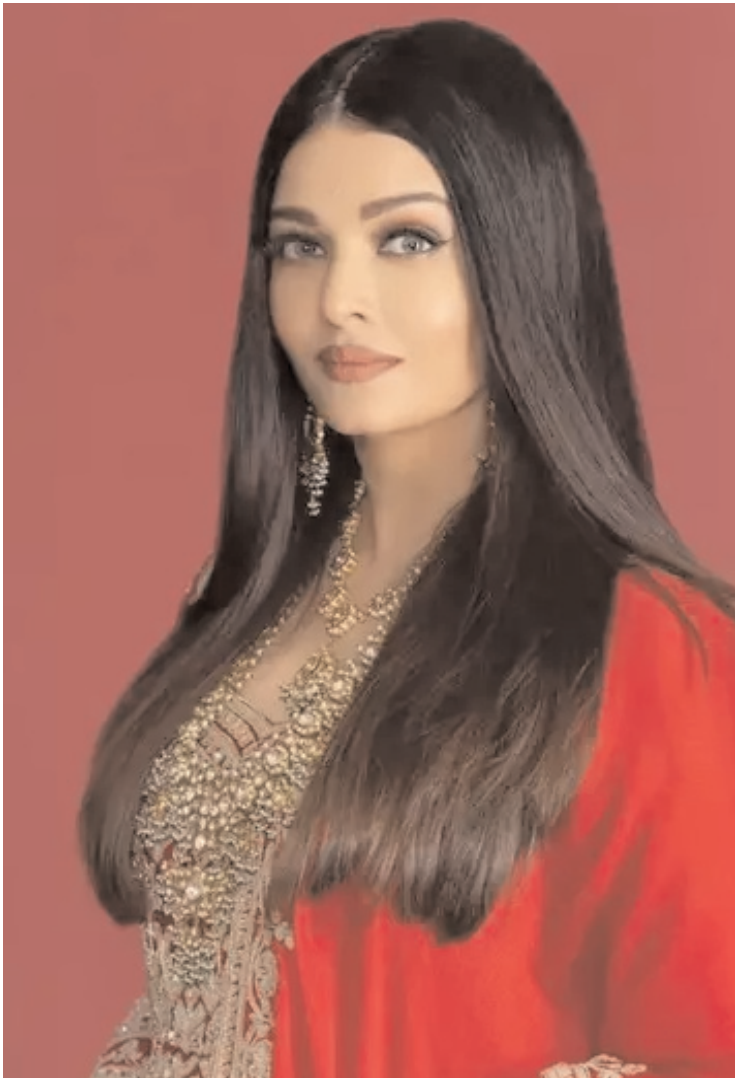
Eternal beauty Aishwarya on the global canvas when Rai Bachchan made a splash she was crowned as Miss