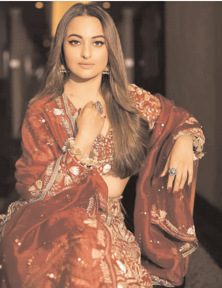
Iqbal and captioned them, “Laal hai mere dil ka haal” (with a heart emoji).

Bollywood actress Sonakshi Sinha took to her social media handle and shared a carousel of pictures from her latest photoshoot.