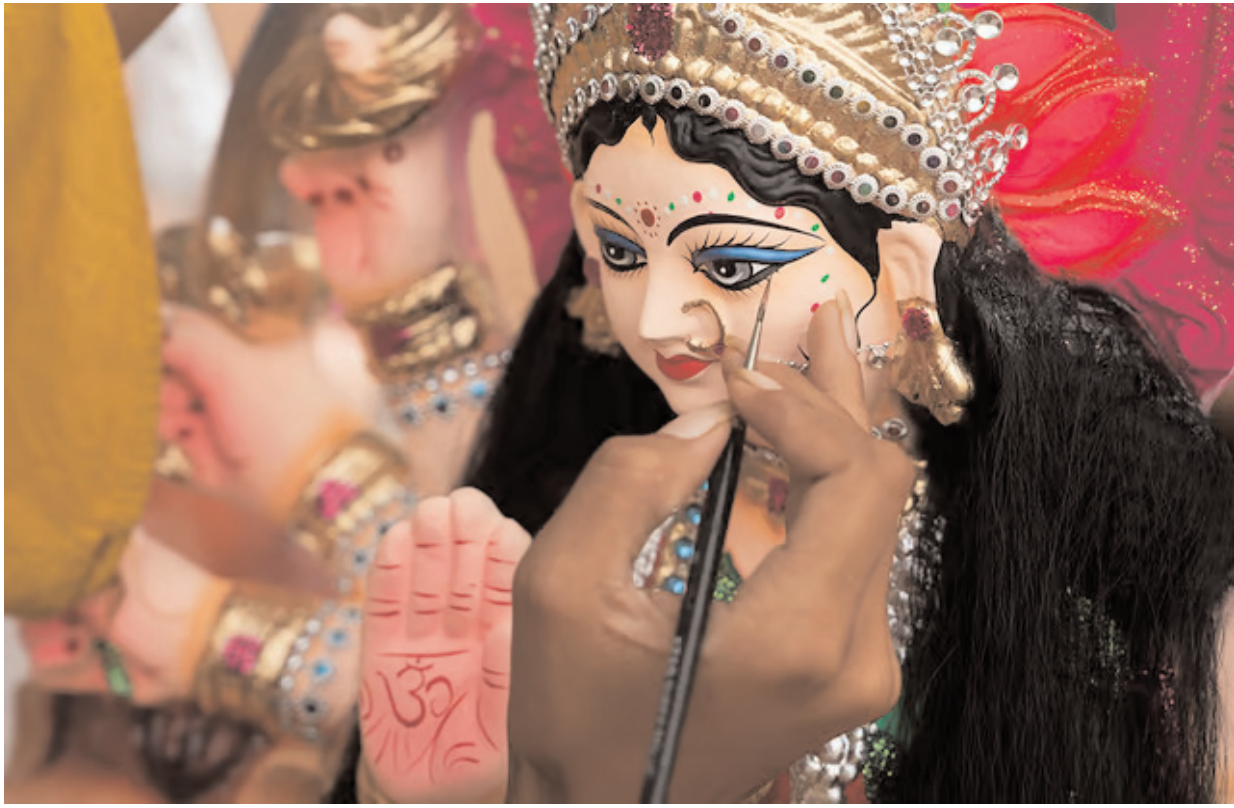
An artist gives finishing touches to an idol of goddess Durga ahead of the Navratri festival, at Mayur Vihar in New Delhi.