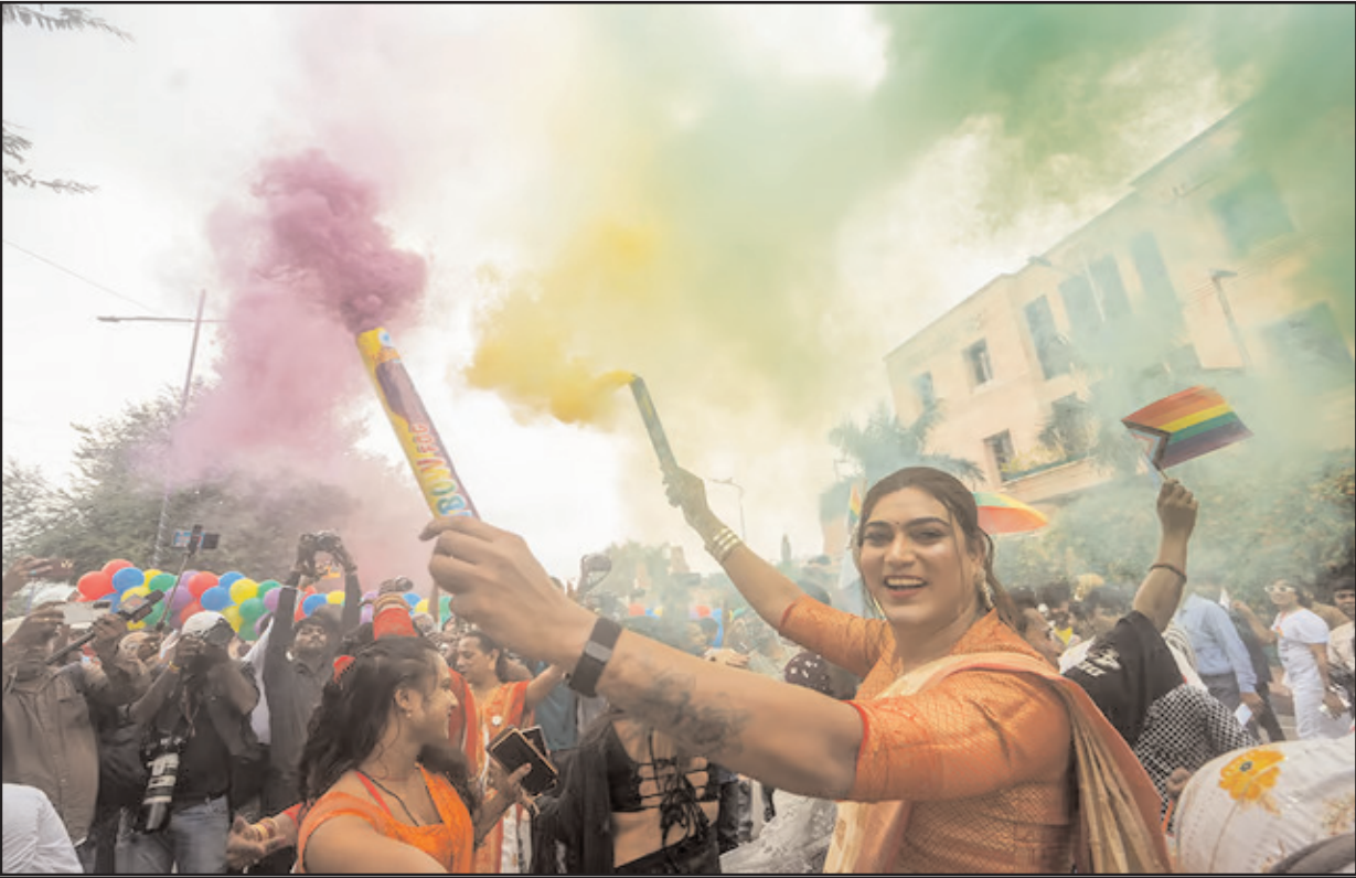
Transgenders during 'pride walk' organised by the Aadishiv Transgender Foundation, in Lucknow.