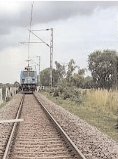
BALLIA (UP), SEP 30