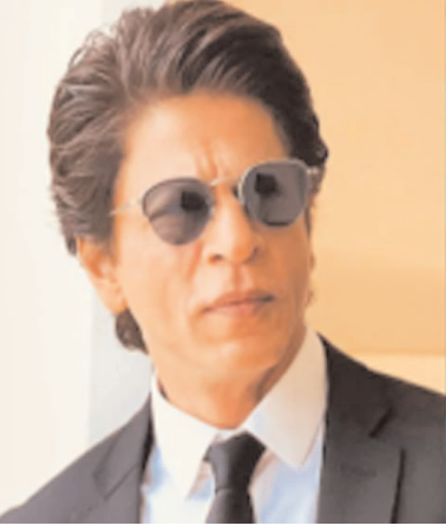
YAS ISLAND (ABU DHABI), SEPT 30